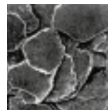
Polymer-Injected Mica Microscope Photo

requirements by using a PMD (Polymer-injected Mica Diaphragm) cone woofer. This diaphragm is composed of 30% high quality white Indian Pearl Mica, chosen for the significant contribution it makes to sound quality. In order to maximize its distinctive qualities, absolutely no coloring is added to the material. We've also varied the cone thickness, making it thicker in the middle, which has been shown to improve performance. The cone is extremely light, yet also tough and durable, with excellent response speed.