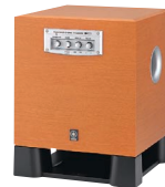
YST-SW215 Advanced YST and QD- Bass Subwoofer

• Product designs and specifications are subject to change without notice.