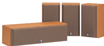
NS-P70 Center and Surround Speaker Package