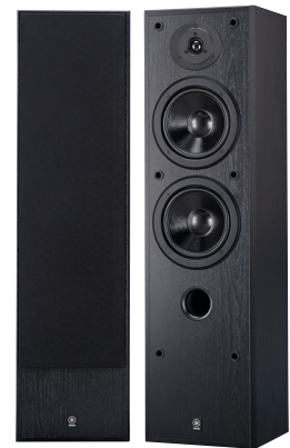
Black finish available